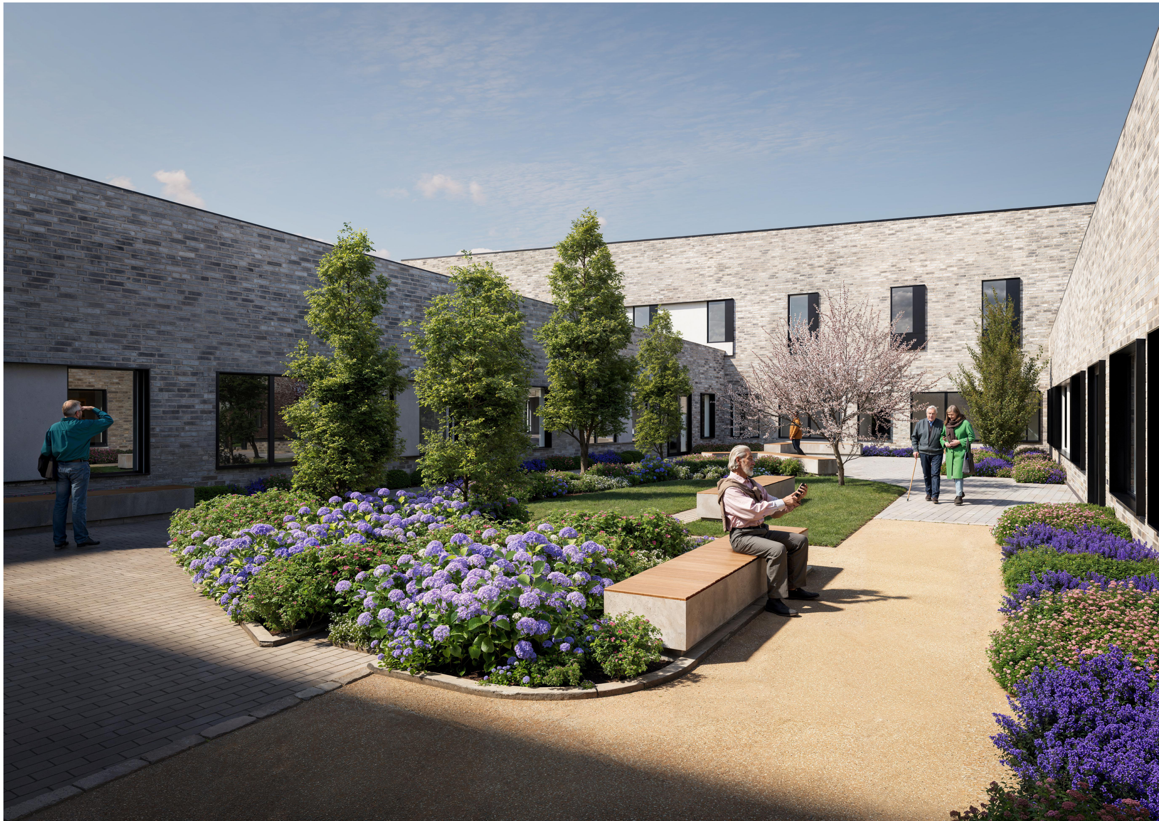
200-bed Adult In-Patient Hospital Older Age Courtyard

COPYRIGHT: The design and details shown on this drawing are applicable to The Named Project only and may not be; reproduced, modified or relayed in whole or part or be used for any other project or purpose without the prior written permission of TOT Architects with whom copyright resides. DO NOT SCALE this drawing. Use figured dimensions only. The Contractor is responsible for checking all levels and dimensions on site prior to commencement of works. Any discrepancies are to be referred to the ARCHITECT. Drawings to be read in conjunction with all other Consultants Drawings & Specifications were relevant. Proprietary items shall be fixed in strict accordance with the Manufacturer's Instructions. Sizes of proprietary items shall be checked with Manufacturer.